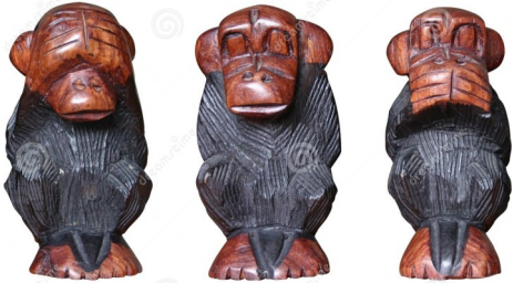
見猿 MIZARU see no evil