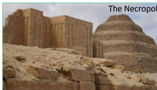
The Necropolis of Saqqara near Cairo