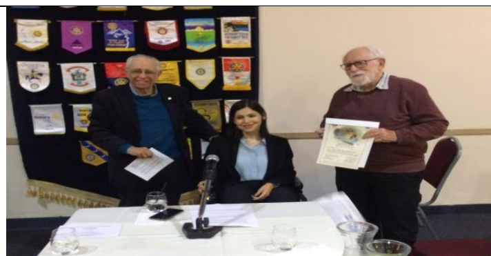
Elections – MK Karine Elharar of Yesh Atid