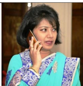
H.E. The Ambassador of Nepal