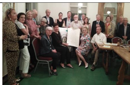
Italian Hope for Peace In the Mediterranean