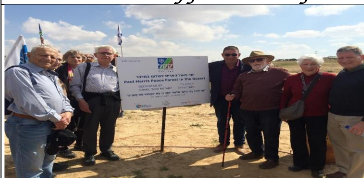
1st Trees - The Paul Harris Forest of the Desert