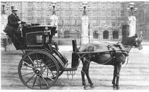
HANSON CAB photographed in London in 1895.