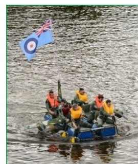
Marshall Air Services Top Gun

fighter tribute to Top Gun. The best pub entry was by Old Harkers Arms with an amazing Yellow Submarine tribute to The Beatles. Best ladies raft was entered by The Druids Inn 'I Am Sailing'. The best school entry was Queens Lower School with 'The Queen of Hearts'.