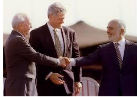
Rabin, Clinton, King Hussein