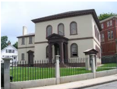
Touro Synagogue, Rhode Island

more than a decade while leading France against a series of coalitions during the Napoleonic Wars. He won many of these wars and a vast majority of his battles, building a large empire that ruled over much of continental Europe before its final collapse in 1815. Napoleon is regarded as one of the greatest military commanders in history, and his wars and campaigns are studied at military schools worldwide. His political and cultural legacy has made him one of the most celebrated and controversial leaders in human history. The coronation of Napoleon as Emperor of the French took place on Sunday, December 2, 1804, at Notre-Dame de Paris in Paris. It marked "the instantiation of modern empire" and was a "transparently masterminded piece of modern propaganda". Napoleon wanted to establish the legitimacy of his imperial reign, with its new dynasty and new nobility. To this end, he designed a new coronation ceremony unlike that for the kings of France, which had emphasized the king's consecration ( sacre ) and anointment and was conferred by the archbishop of Reims in Reims Cathedral. Napoleon's was a sacred ceremony held in the great cathedral of Notre Dame de Paris in the presence of Pope Pius VII.