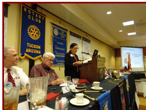
Meeting at the Tucson Rotary Club—2015