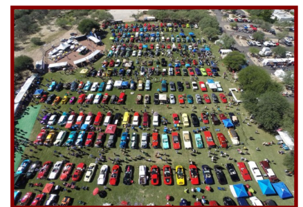
The historical Car Show 2016

Fundraising projects are the Classics Car Show and a Ride to End Polio now. In this year's 10 th Classic Car Show, on the 15 th of October, the club presented 425 cars. The show is visited by tens of thousands of visitors, and the club finds more than 670 volunteers to organize everything on this day. Among the local project, there is a Triangle Y Boy Scouts Camp Clean-up Day and Bell Ringing for the Salvation Army.