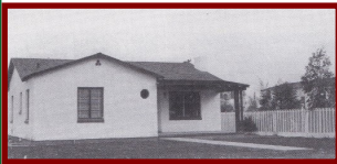
Childhood home in Tucson, Ar.

When she was five years old, her father died. Because of her asthma attacks Susan's mother moved to Tucson, Arizona, where she with Susan lived for twelve years, till 1945. That year, her mother married again, and little Susan got her stepfather's surname: Susan Sontag.