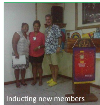
Inducting new members