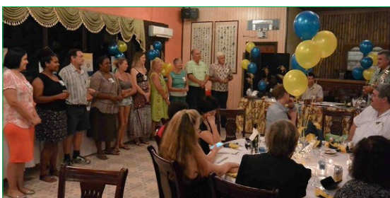
Changeover Dinner, Note the same balloons as seen at another Club's changeover dinner