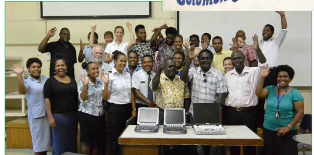
Rotary Clubs of Honiara and Aspley handing over Hand over of portable echocardiogram machines to the National Referral Hospital in the Solomons

three year postings. This leads to a continuing challenge to replace the twelve to fifteen members who leave each year. Membership was