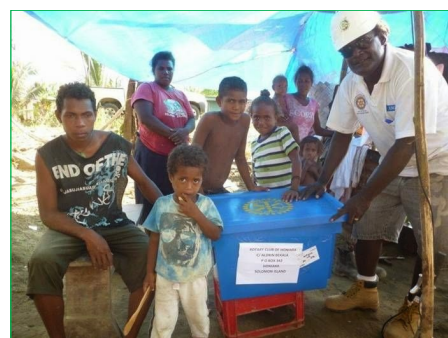
Honiara Rotary Club distributing Rotary Emergency Response Kits from the Rotary Clubs of New Zealand after tidal wave flooding in the Solomons